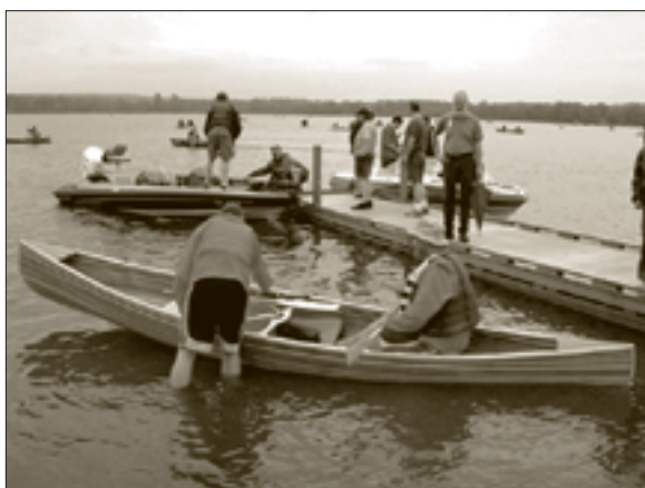
Despite some inclement weather, about 300 people participated in this year's Fishing for Scholarships tournament.