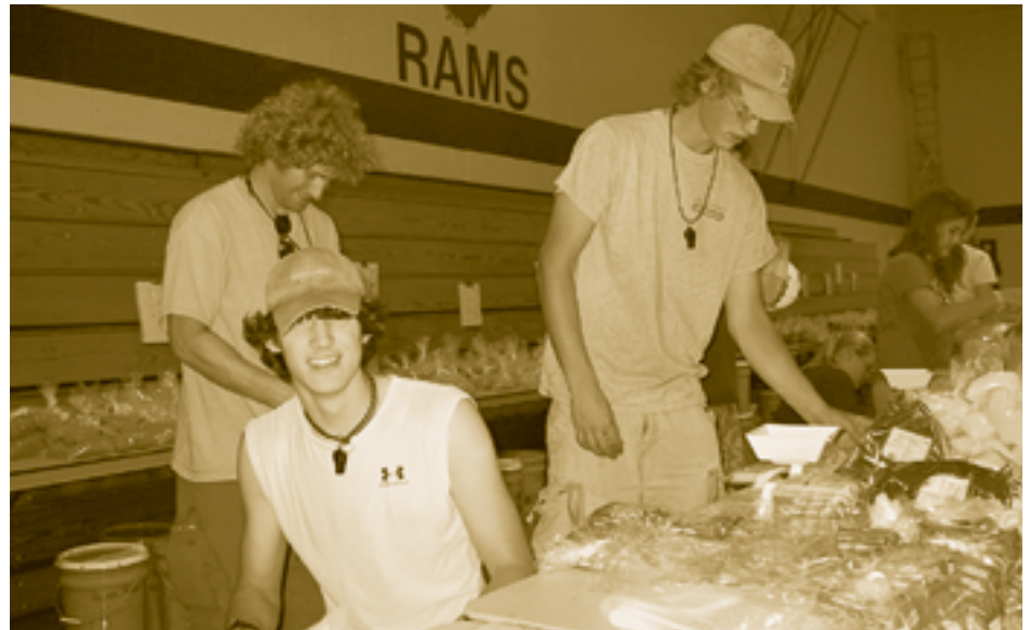
HIOBS students prepare food for their "wilderness America" semester.

Unity College's affiliation with Outward Bound has proven to be mutually beneficial. HIOBS offers trained instructors, an extended, very real experience in the field