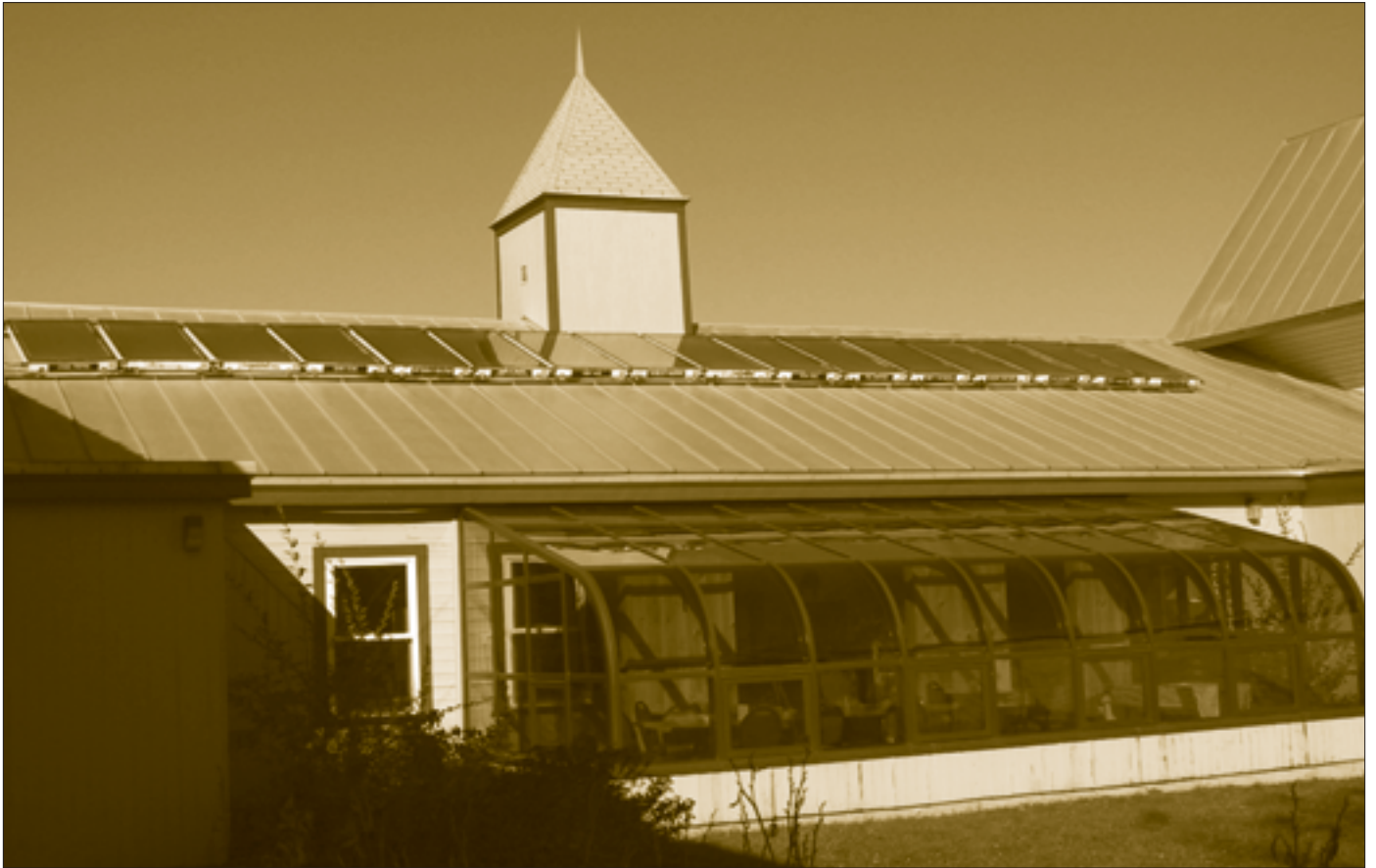
The Jimmy Carter panels atop the cafeteria heated water for the facility from 1992 until the fall of 2004.

historical artifacts,” Womersley explained. Ideally, Womersley would like to see them raise money to support Unity undergraduate environmental degree programs, and to purchase replacement renewable power systems in wind, modern solar photovoltaic, and modern solar heating.